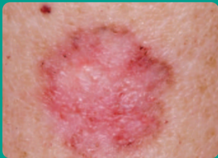
basal cell carcinoma