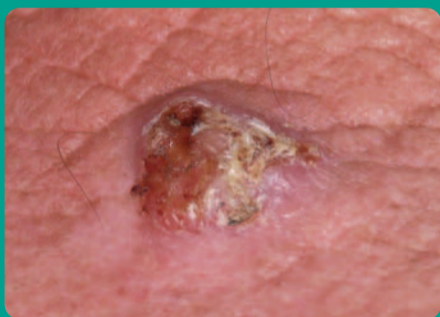
squamous cell carcinoma